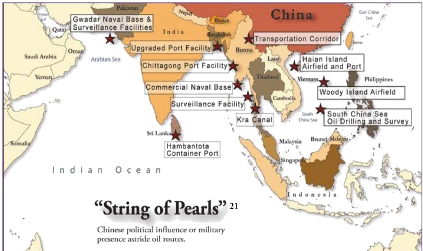
Figure 1. China’s Countries Project along the Indian and Pacific Ocean Littorals

policies on maritime issues, which some experts perceived as a fundamental part of its national strategy. This diplomatic strategy is later known as the “String of Pearl”.