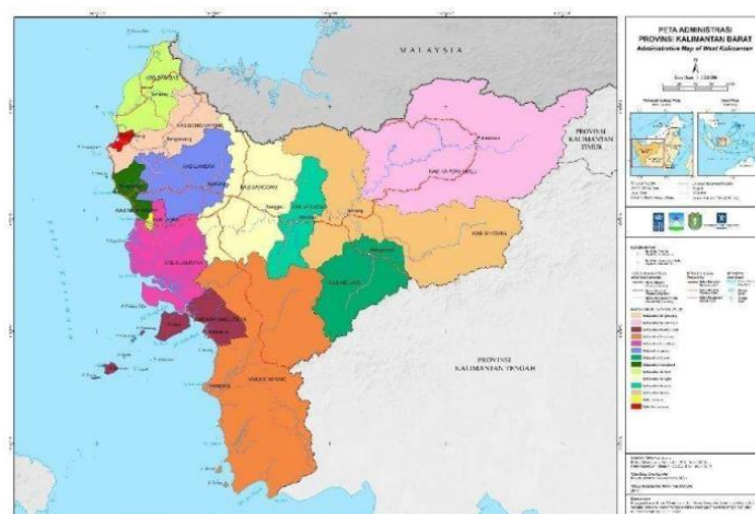
Figure 2. Map of administrative boundaries of west Kalimantan Province

The waters of West Kalimantan are part of the Lantamal XII working area with a coastal length of \pm 1000 KM consisting of 9 Posal, which is to the North of Posal Temajok and in the South posal Kendawangan as for the boundaries of lantamal XII working area: